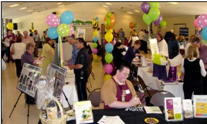
The Los Altos Chamber's 23rd Annual Business EXPO filled the Los Altos Youth Center on April 28.